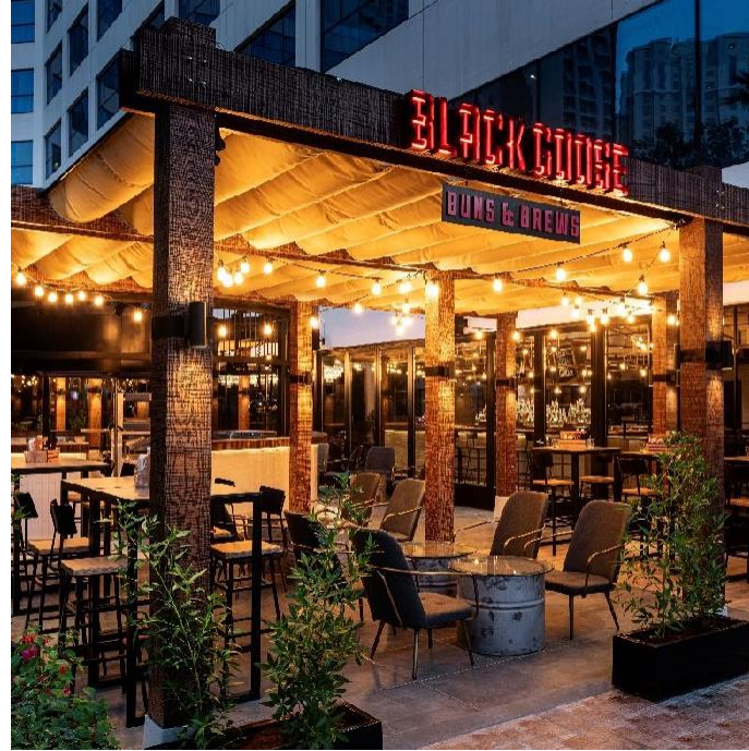
Black Goose Buns & Brews Open Daily 12:30PM – 3:00AM