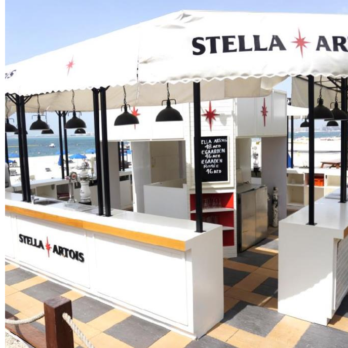
Stella Beach Bar