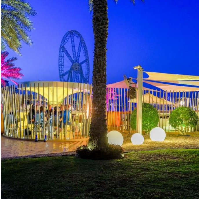
Bliss Beach Lounge