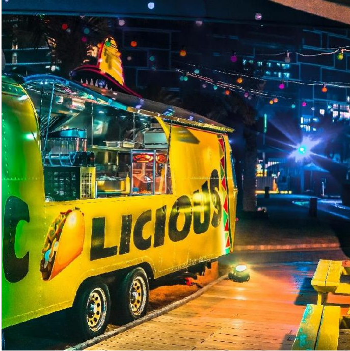
Tacolicious Food Truck Open Daily 12:00PM - 9:00PM Tacos & More