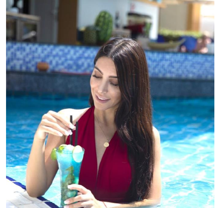
Azure Pool Bar